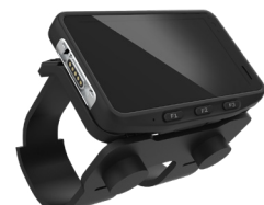
The CW45 Rugged Wearable Mobile Computer

purposefully designed to withstand today's warehouse environments while increasing overall workflow productivity. At the same time, it must be easy to use and comfortable enough to wear all day, every day. They need a solution that is going to improve the overall productivity of what has become a highly mobile workforce, eliminate wasted time and energy renewing consumer-based devices, and lower their total cost of ownership while increasing their topline revenues.