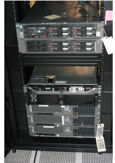
An exacqVision IPS-2000 2U Rackmount IP Camera server sits on this rack along with COTS servers and other network hardware.