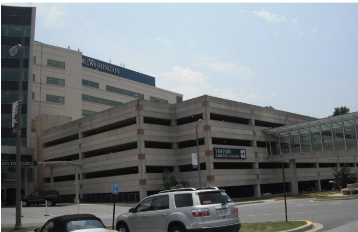
One of the parking garages on the BWMC campus