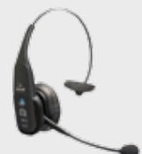
• 95ACC0002 Bluetooth Headset VXI B350-XT