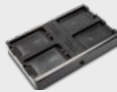
• 94A150074 4-Slot Battery Charger