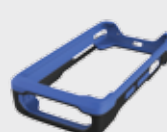
• 94ACC0132 Rubber Boot