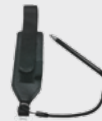
• 94ACC0133 Hand Strap (Included with purchase)