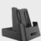
• 94A150095 Single Slot Dock