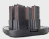
• 94ACC0192 4-Slot Battery Charger