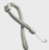
• 91ACC0036 Lanyard