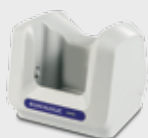
• 91ACC0072 Single Slot Cradle Locking