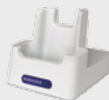
• 91ACC0073 Single Slot Cradle Charge only