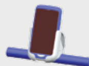
• 91ACC0047 Trolley Holder (60 pcs)