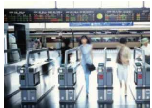
Access control and Ticketing