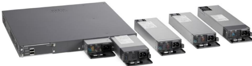
Figure 2. Cisco Catalyst 2960-XR Series power supply

Table 1 shows the different power supplies available in the 2960-XR Series switches and the available PoE power. Table 2 lists the PoE and PoE+ power capacity for the Cisco Catalyst 2960-X and 2960-XR Series. Table 3 gives the available PoE and switch power for the 2960-XR Series with different power supply combinations.